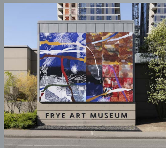
Frye Art Museum