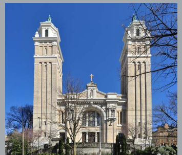
St. James Cathedral