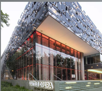
Seattle Opera Center